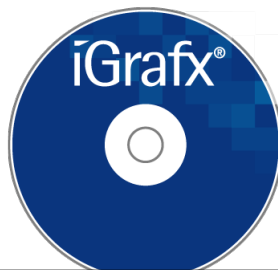
First CD: iGrafx