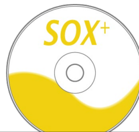
Second CD: SOX+